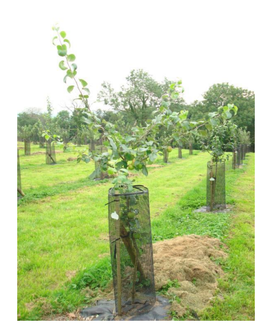
Figure 6 - Lane's Prince Albert in 2010

Regarding the plums and pears, there wasn't half as much science in the selection — more a question of getting a variety of ripening periods, cross-pollination and some chance of coping with the conditions. I settled on a Damson (Shropshire Prune), Marjorie's seedling plum, Greengage (some hope!), Rivers' Early Prolific plum, Hessle pear, Concord, Williams Bon Chrétien, and Conference. All except for the Conference grew OK but only now are they starting to yield much fruit. The Conference had the wettest spot in the orchard, next to the beck and died from canker.