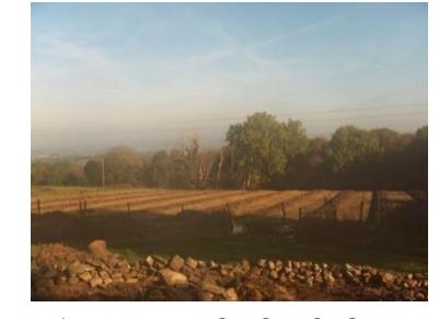
Figure 3 - Newly ploughed orchard

had identified as the site of the orchard, but I was nevertheless a bit surprised when he turned up one day in October 2007, with his tractor, suggesting that we ploughed some furrows to plant the trees. On the grounds that you don't argue with farmers on tractors, and that you certainly don't turn down an offer to save many hours of back-breaking work, we set to work and ploughed 10 beautifully straight rows. I had said that the intention was to plant about 60 trees, which would only have needed 5 or 6 rows, but we got a bit carried away, because the soil seemed good and was getting better with each row we ploughed (see Figure 3).