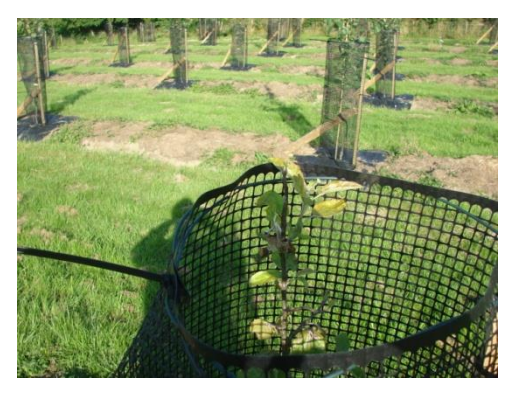
Figure 11 - Sick Sunset after spray

In the second year I decided on a slightly different approach, sowing a green manure crop of clover in some strips, planting potatoes in others and putting weedkiller on the rest. The clover was pretty but was out-competed eventually by creeping buttercup. The potatoes were excellent and untouched by the rabbits. The weedkiller worked as before but with an unpleasant side-effect in that several trees (mostly the Sunset – see Figure 11) were affected by spray drift. Quite why this happened is a bit unclear as there was virtually no wind when I sprayed. I can only think that, since the spray was applied shortly after taking off the rabbit guards, the bark was still fairly green and tender and thus more susceptible than otherwise (of course the previous year,