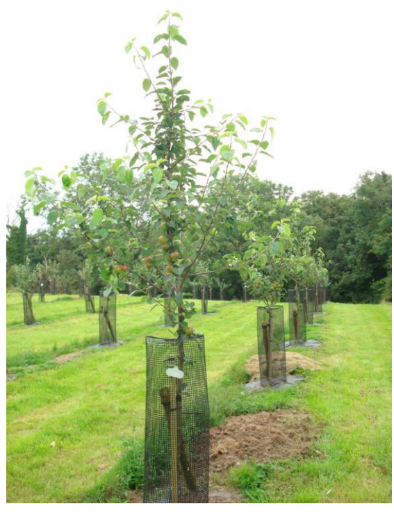
Figure 10 - Dabinett cider apple tree in 2010 with central leader (and quite a few fruit).

I have experimented with the "nicking and notching" approach. Having derided books on pruning, I think that this is best described in an old book I have: "Fruit Growing - Modern Cultural Methods" edited by N.B. Bagenal of East Malling Research Station. This book's first impression was in 1939 - I have the 1945 "war economy standard" edition, which is finer than many of today's books and cost then a princely sum of 30/- (about £150 now, relative to average earnings). For £10 in a Hay bookshop, I reckon it was good value! Generally, it is an excellent book, although a bit out of date in its recommended use of lead arsenate etc. (it also mentions a new wonder chemical – DDT – that will be available after the war and may largely replace many existing sprays, being "non-poisonous, safe and pleasant to use, and unlikely to cause spray damage").