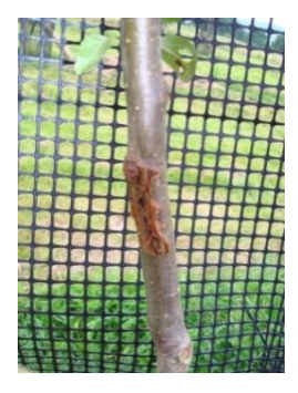
Figure 4 - Papery bark canker on Fiesta

Ten years on, it is clear that some varieties are doing better than others. Initially, the biggest disappointment was the Fiesta. After planting it, I read in "The Fruit Garden Displayed" that it is "prone to toxicity and canker on acid soils less than pH 6". I can testify to this. Most of my Fiesta was hit by a severe form of peeling, papery bark canker (see Figure 4).