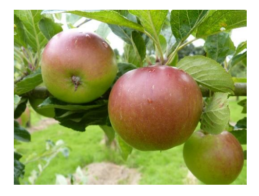
Figure 5 - Fiesta in August 2014

evidence of having fallen! Other varieties (particularly the triploid ones) are much more vigorous. This can cause problems with wind damage (see below under "staking"). The trees with vigorous but whippy growth (i.e. more like a plum)