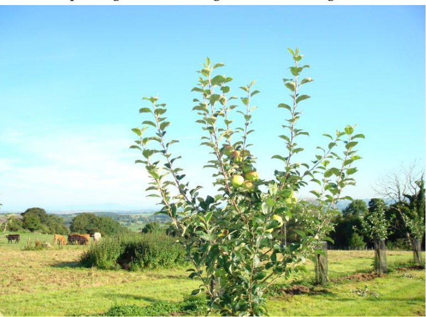
Figure 12 - Keswick Codlin 2010. The leader was summer-pruned out, but only down as far as the apples!

The idea in planting fruit trees is to get fruit. I tried to ignore this for the first year or two, assiduously