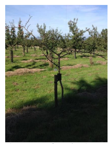
Figure 8 - Dead Lane's Prince Albert (2015)

Deciding that Radio 4 alone was probably an insufficient deterrent, I put plastic mesh fences 4ft high around every tree. This seemed easier, cheaper and less ugly than putting a big fence round the whole