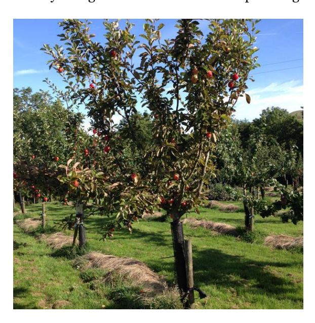
Figure 7 - Strangled Katy in 2015 after most of the early crop had fallen (note the off-colour leaves)

I had quite a bit of bother with rubber tree ties breaking – particularly in strong winds. There is nothing quite as useless as something that fails just at the moment when it needs to function most, so I replaced the ties with some stout plastic rope. This is particularly unyielding and very effective at cutting into the bark as the tree grows so you do have to remember to check them every year. Needless to say, I failed to do this and successfully managed to strangle a Katy