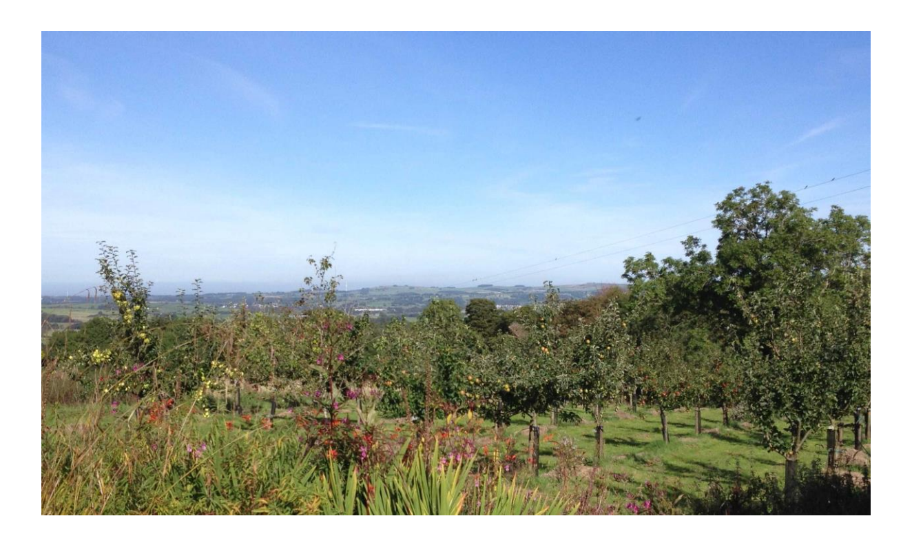
Figure 13 - The Orchard in September 2015